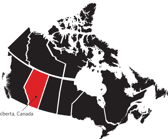
Edmonton, Alberta, Canada

0117, 11762-106 Street Edmonton, Alberta, CANADA T5G 2R1