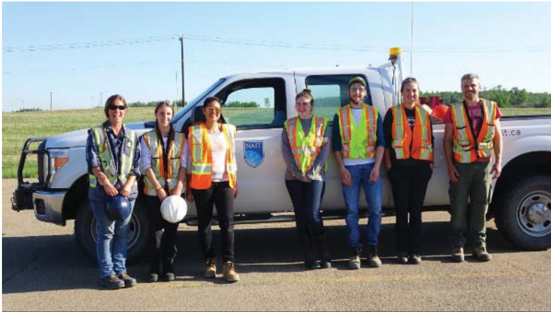
Reclamation team getting ready to set up research trials.

A sincere thank you to all partners and sponsors of "Partners in Boreal Education": Canfor, Boucher Brothers, DMI, FRIAA, West Fraser, Zavisha.