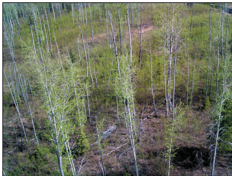
Figure 1. Aerial view of 10% dispersed green tree retention at EMEND.

The EMEND experiment provides an experimental template where six levels of dispersed green-tree retention (0-2%, 10%, 20%, 50%, 75% and 100% or uncut) were applied to whole forest stands >10 ha. These retention treatments were replicated 3 times over 4 dominant stand types (deciduous dominated canopy – primarily aspen and balsam poplar; deciduous canopy with developing understory of white spruce; mixed deciduous-conifer canopy; and conifer dominated canopy – primarily white spruce). In total 72 experimental stands were monitored 1, 2 and 5 years post-harvest. Within each stand, forest arthropods were sampled using pitfall trapping, a simple and inexpensive method that targets ground arthropods (mostly beetles and spiders). Monitoring at the EMEND site will continue for the length of an entire forest rotation.