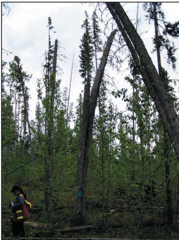
Figure 3. Regeneration in a low retention harvest at EMEND.

The effects of harvesting were demonstrably greater for species in conifer and mixed stands than in deciduous dominated stands. This is consistent with what we expect given forest succession in this region. Typically vegetative growth and suckering by deciduous species is common following harvesting in this region. Thus after harvest, deciduous stands re-establish as deciduous stands. In contrast, conifer stands experience a greater 'net' change in terms of forest composition as they too return with a much larger deciduous component. Thus resident biodiversity in conifer and mixed stands may face an overall larger, and more long-term, environmental change than resident biodiversity in deciduous stands.