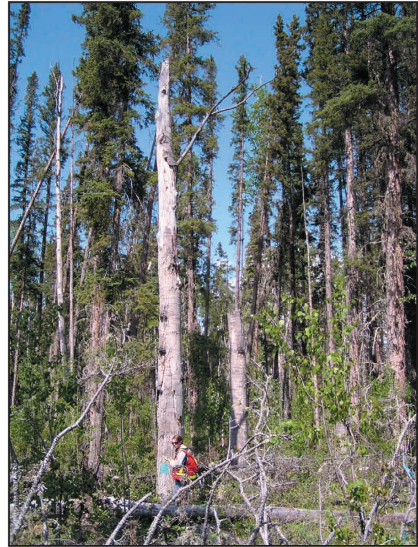
Figure 2. Coniferous dispersed retention harvest at EMEND.