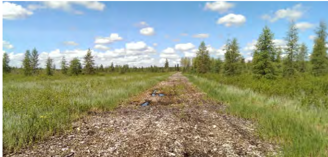
A. Summer 2015: pre-reclamation