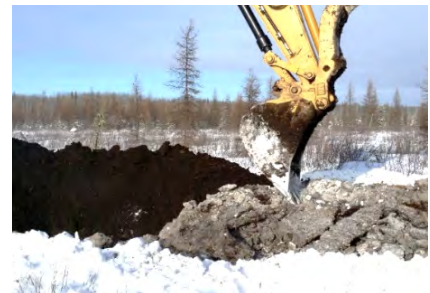
Figure 3. Stripping chips and piling of peat using a backhoe.