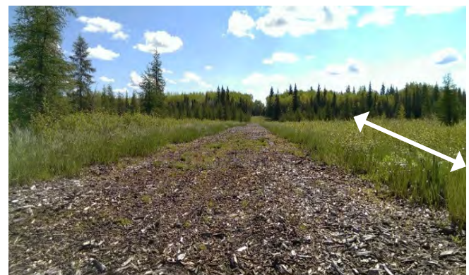
Figure 1. Wood chip road prior to reclamation in summer 2014. White line indicates buried pipeline parallel to the road.

The road, which led to a decommissioned exploration well pad, was approximately 6 m wide and 400 m long. It was built with wood chips (average 50 cm deep) from a nearby upland site and placed directly on top of the peat without any geotextile.