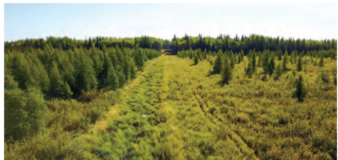
D. August 2017: 2 years after reclamation