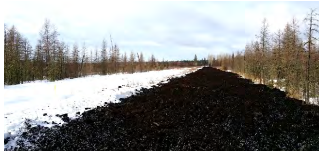
B. February 2015: immediately after reclamation