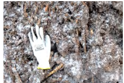
Figure 2. Thick wood chip overburden (top) and close-up of the fine wood chips (bottom).