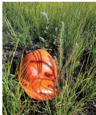
Figure 6. Healthy planted spruce seedling and natural regeneration of willow