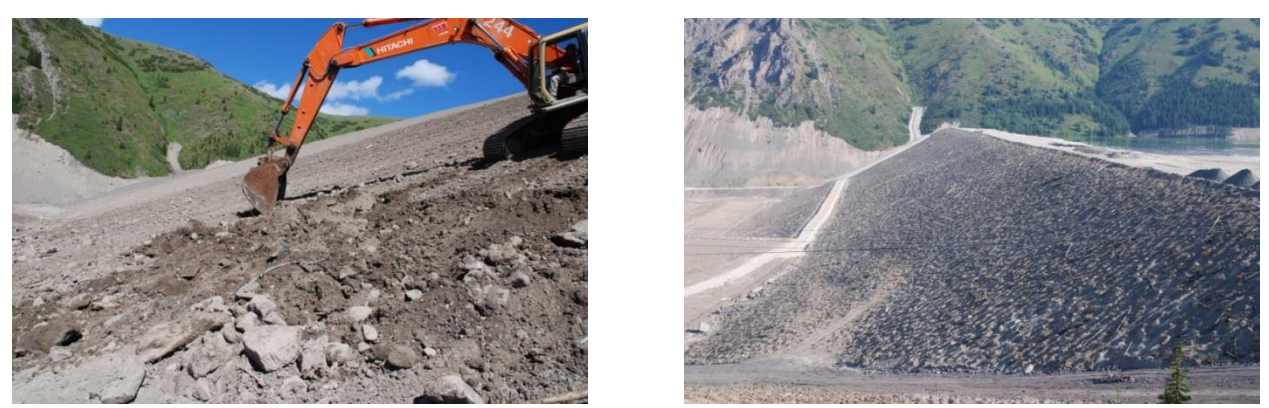
Photograph 1 (left) and 2 (right). Rough and loose surface configurations can be made using an excavator on slopes up to 2:1 or 26°. Large areas can be treated for a cost of about $700/ha.

Rough and loose surface treatments can be used in confined areas as well as in large open areas (Photograph 3). These treatments are ideal for recovering hydrologic integrity on resource access roads and where unauthorized access by motor vehicles ("quads" and "dirt bikes") is causing ecological degradation. The rough and loose treatments can be used on coarse textured substrates and can be applied in areas where potentially droughty conditions dictates that planting be conducted on north facing slopes (Photograph 4).