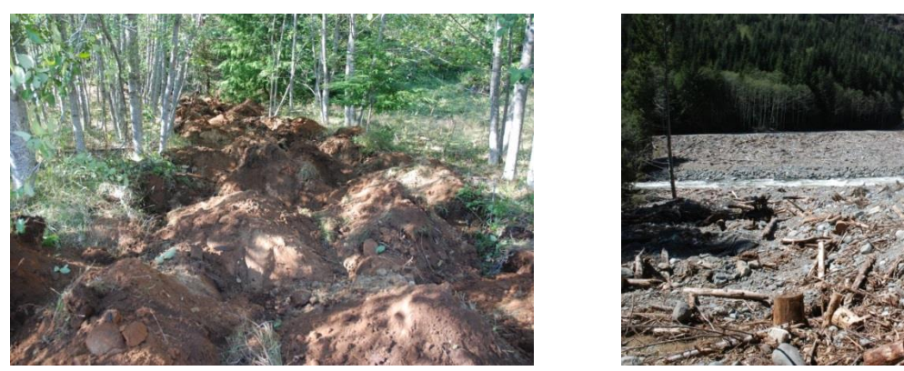
Photograph 3 (left) and 4 (right). Forest access roads and other small areas can be treated using the rough and loose technique (left) as well as areas with coarse substrates (right) such as this old dam site with alluvial boulders, cobbles and gravels.

Rough and loose surface treatments can be used in confined areas as well as in large open areas (Photograph 3). These treatments are ideal for recovering hydrologic integrity on resource access roads and where unauthorized access by motor vehicles ("quads" and "dirt bikes") is causing ecological degradation. The rough and loose treatments can be used on coarse textured substrates and can be applied in areas where potentially droughty conditions dictates that planting be conducted on north facing slopes (Photograph 4).